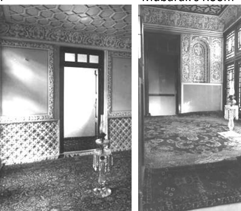
Upper Room where the Báb Declared Mission