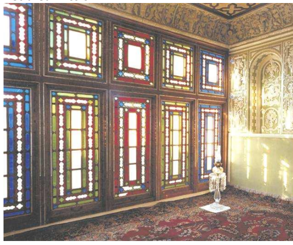
Upper Room where the Báb Declared Mission