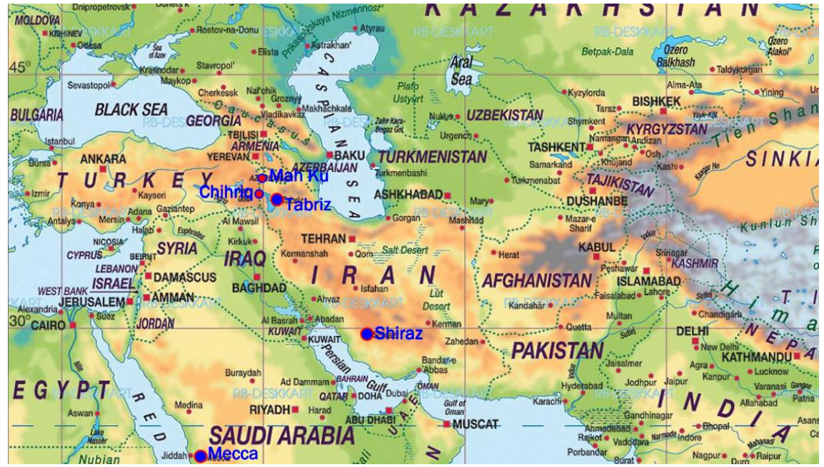
Map showing the place of birth (Shíráz), public declaration (Mecca) and martyrdom (Tabriz) of the Báb, as well as Máh Kú and Chihriq.