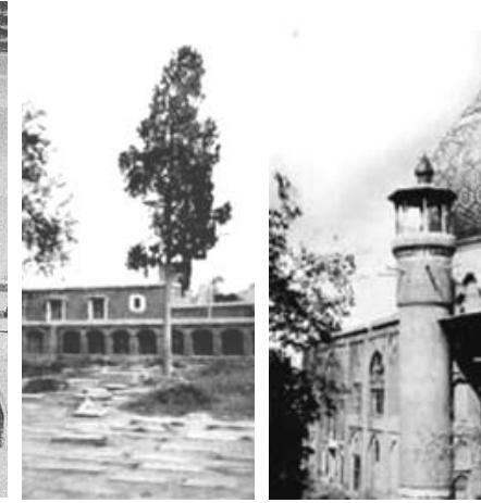
Tree Marking the Báb's Infant Son in Babi-Dukhtaran Shiraz